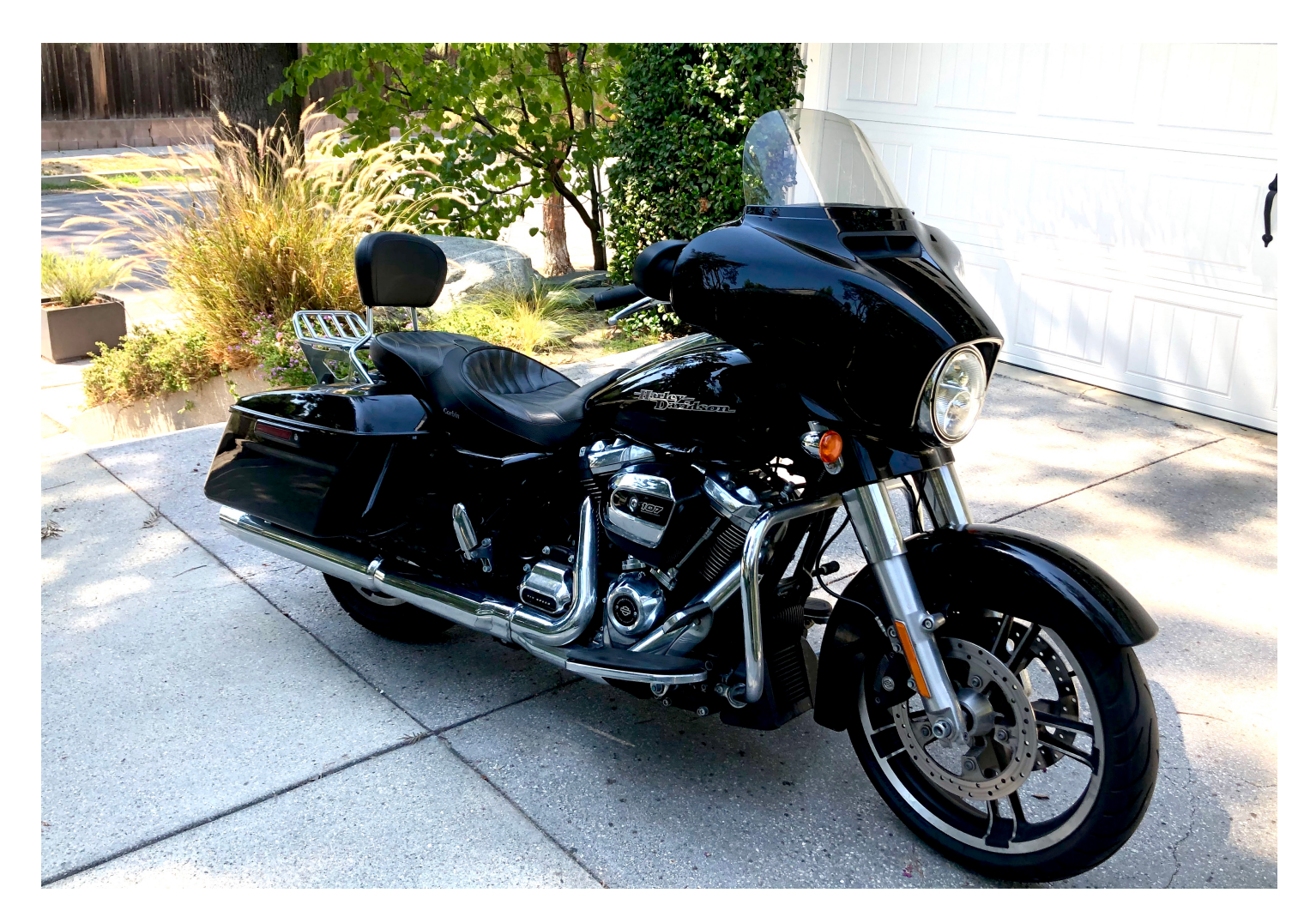
FOR SALE. 2017 Harley Davidson Street Glide Special. 17,500 miles. Good tires.

Engine and exhaust are stock. Bike has Corbin seat, Ohlin shocks, and heated handgrips. $16,995.