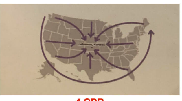
4 CPR Four Corners Prayer Ride Praying for a nation needing life and positive deeds pumped into it.