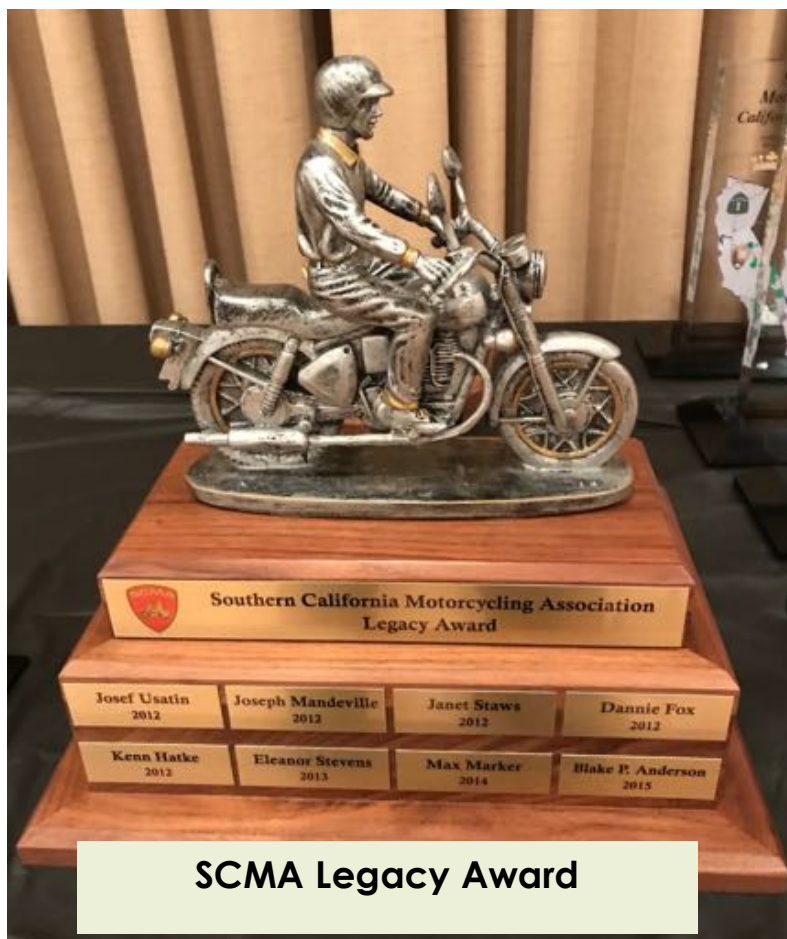
SCMA Legacy Award