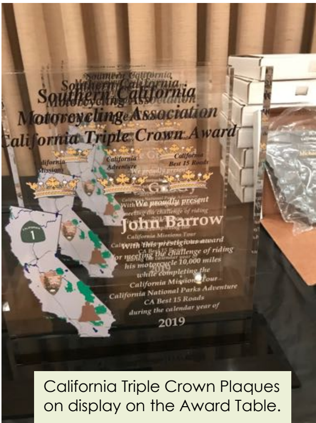
California Triple Crown Plaques on display on the Award Table.