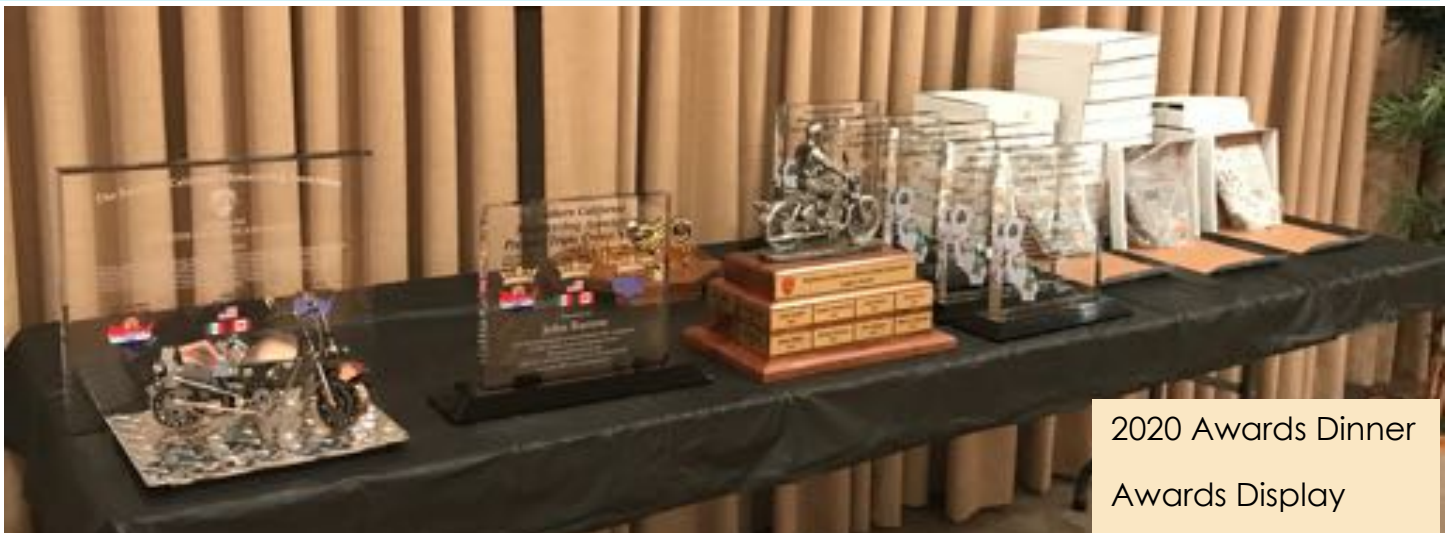
2020 Awards Dinner Awards Display

Businesses interested in sponsor membership advertising of a half page ad in the newsletter for 12 months, and prominent mention at SCMA's March Awards and Appreciation Banquet and the September Three Flags Banquet, should contact the Chairman.