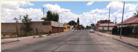
Through the heart of Winslow AZ

I hadn't done that in a long time and think such opportune jaunts should be done more often! (now I just need to remember to take more photos !!)